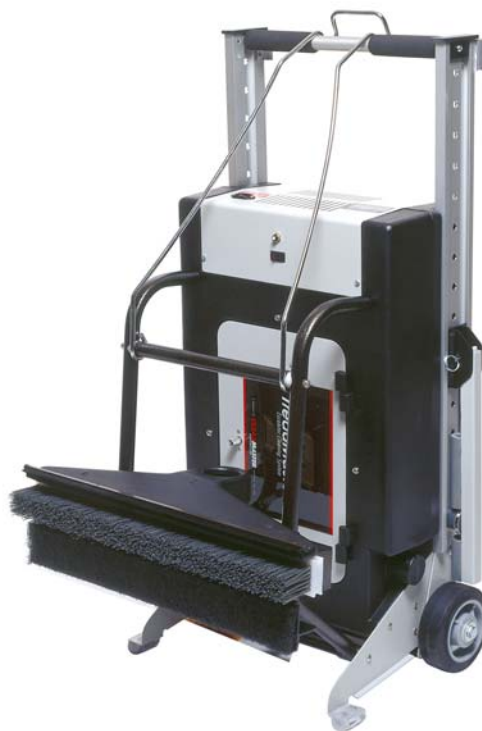
Effortless Escalator Cleaning

Simply position the TreadMaster at the bottom of the escalator, lower the tread-wide cleaning head into position, and activate the escalator. Without any repositioning during any part of the cleaning process, TreadMaster cleans any tread width completely and thoroughly.